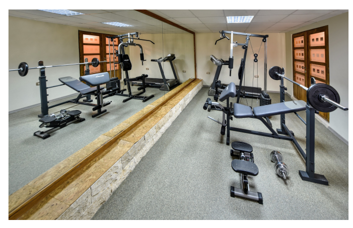
DOWNLOAD ALL IMAGES