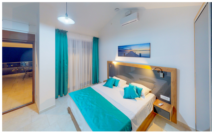
DOWNLOAD ALL IMAGES